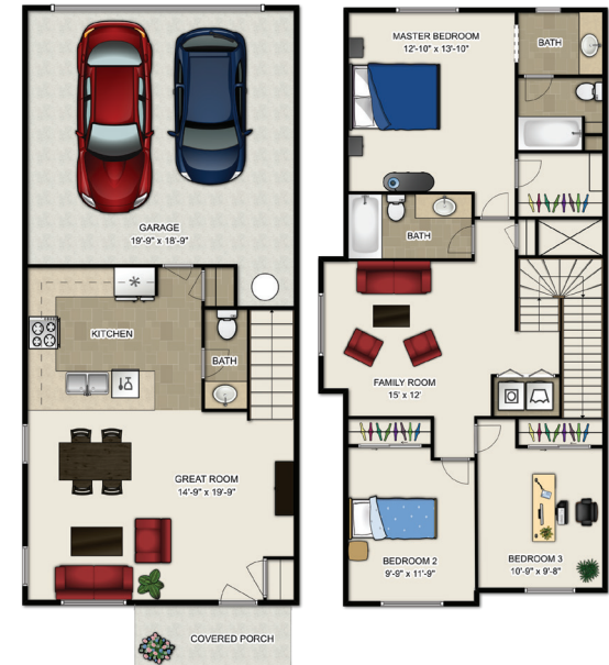
1479 | 3 Bedrooms | 2.5 Baths