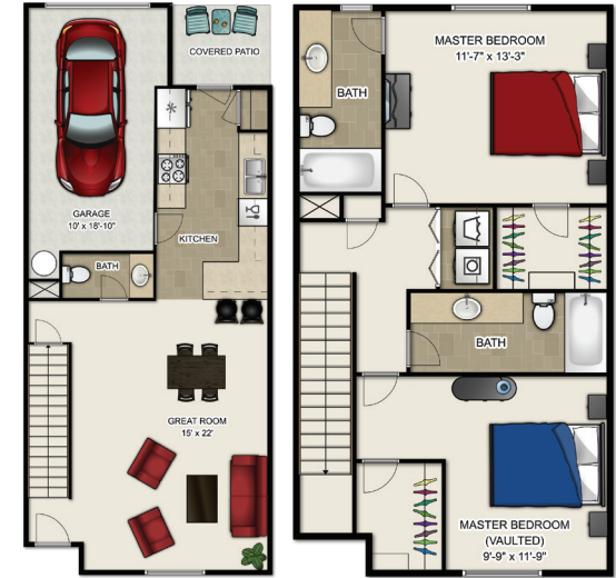
1278 | 2 Master Bedrooms | 2 Baths