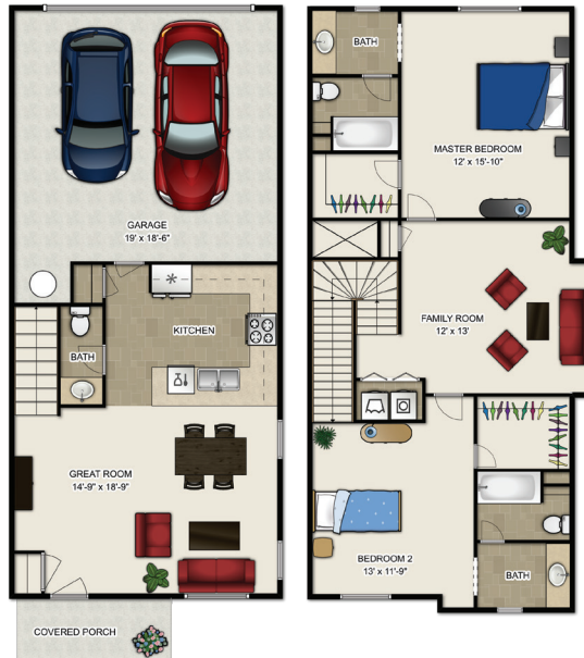
1479A | 2 Bedrooms | 2.5 Baths