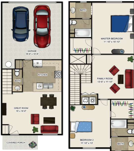
1381 | 2 Bedrooms | 2.5 Baths